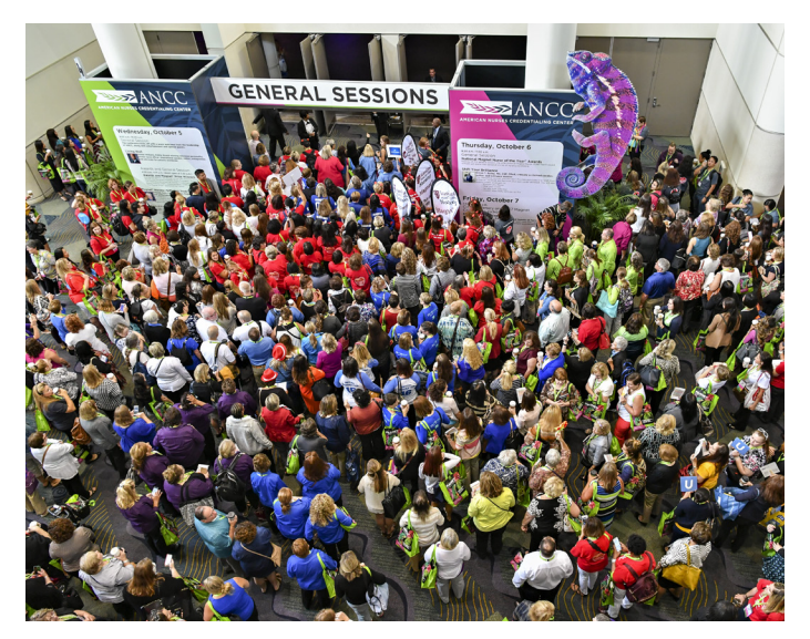
Registration exceeded all expectations, with 9,578 attendees from the U.S. and 26 other countries